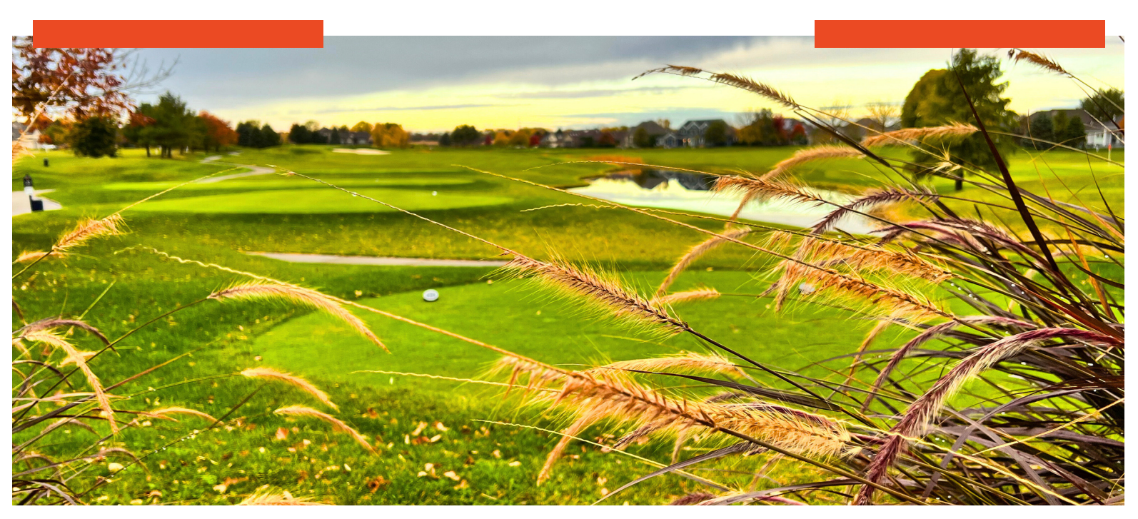
Home of the Men's & Women's Fighting Illini Golf Teams.